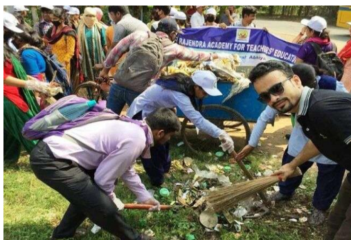
Cleaning of the College Campus

Cleaning is important for the health and safety. Maintaining a clean college environment sets a good example to students. It encourages learners to take pride in their university or college, which makes them less likely to drop litter and as such they will potentially make a bigger effort to maintain their environment. Essential daily and/or weekly campus cleaning includes: